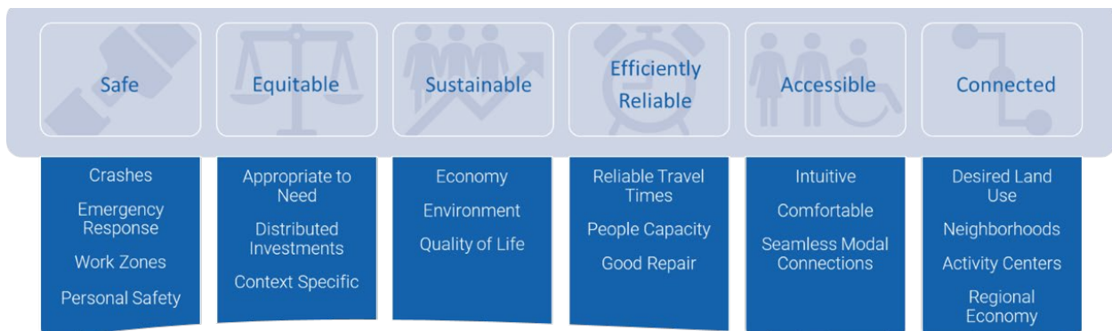
Figure 1: The ConnectCOS Goal Framework

Ted Ritschard (Olsson) provides a summary of the ConnectCOS process. Based on the guiding themes of PlanCOS and the transportation investment priorities, the draft ConnectCOS Plan is based on a six-goal framework (Figure 1). This planning effort aims to serve the people & community, be resource stewards, and remain consistent with PlanCOS.