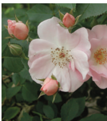
Flower Girl, S, is available at our PPRS Rose Sale.